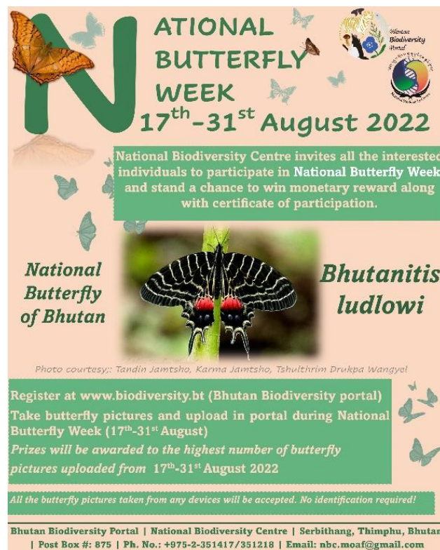
Figure 1. National Butterfly Week Poster

Currently, there is no designated international date for National Butterfly Week. National Biodiversity Centre in collaboration with nature guides hosted Bhutan's first National Butterfly Week from 17 th to 31 st August 2022.