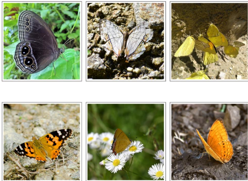
Figure 4. Butterfly observations uploaded by participants