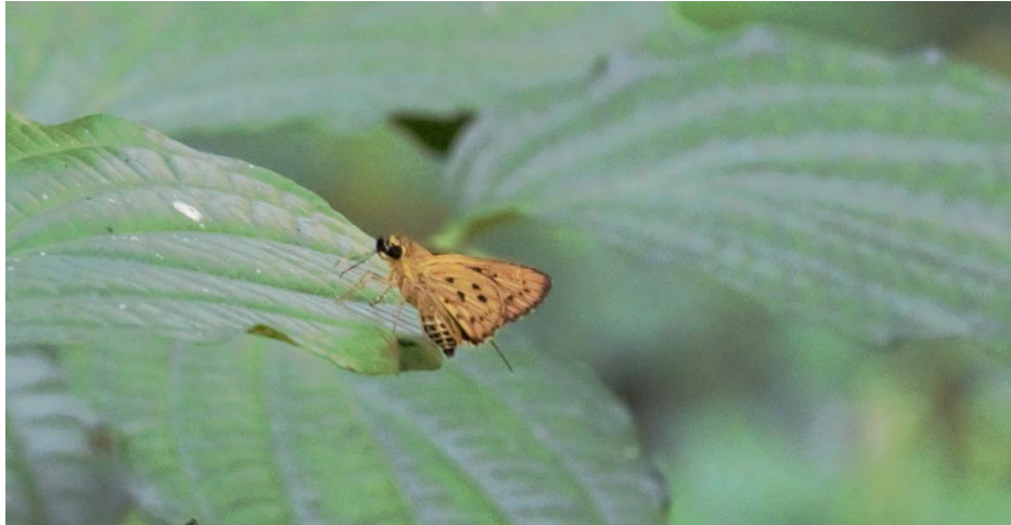
Figure 5. Salanoemia noemi

In addition, a new record of butterfly Salanoemia noemi , commonly known as Spotted Yellow Lancer was uploaded in portal by one of the participants (Figure 5). This species is a new addition to the butterflies of Bhutan, hence a new record for Bhutan.