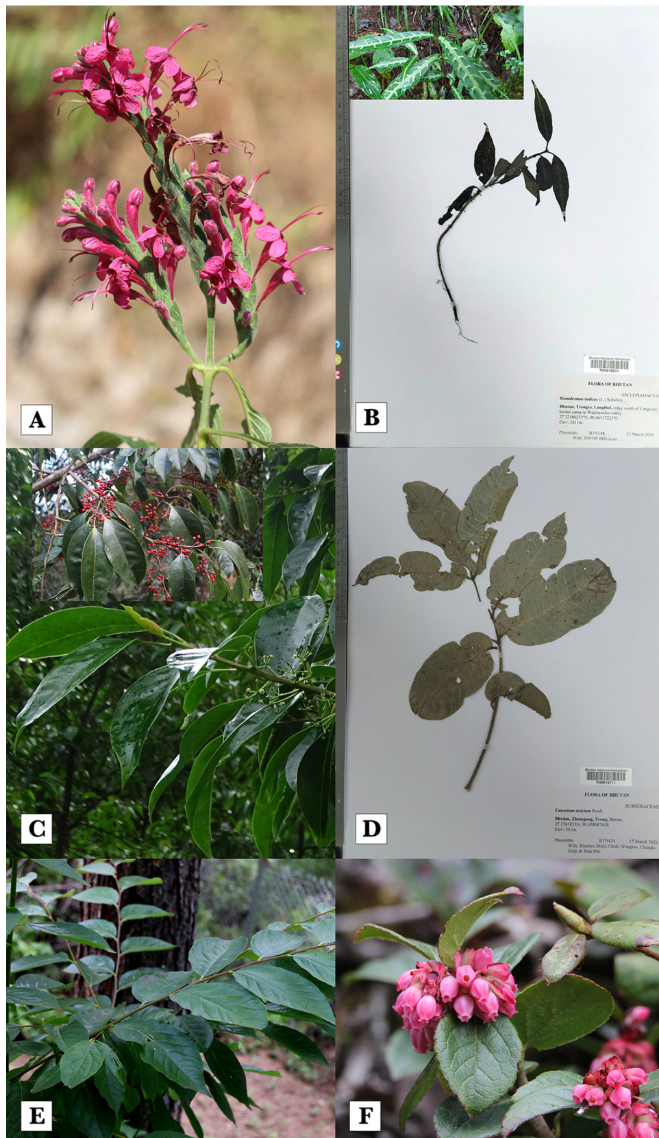
Fig. 2. Newly recorded plant species. A. Eranthemum erythrochilum from Dagana district. B. Hemidesmus indicus from Langthel, Trongsa. C. Ilex umbellulata from Menchuna, Punakha. D. Canarium strictum from Zhemgang. E. Ehretia acuminata from Nyzerkha, Thimphu. F. Vaccinium sikkimense from Thrumshingla Pass.