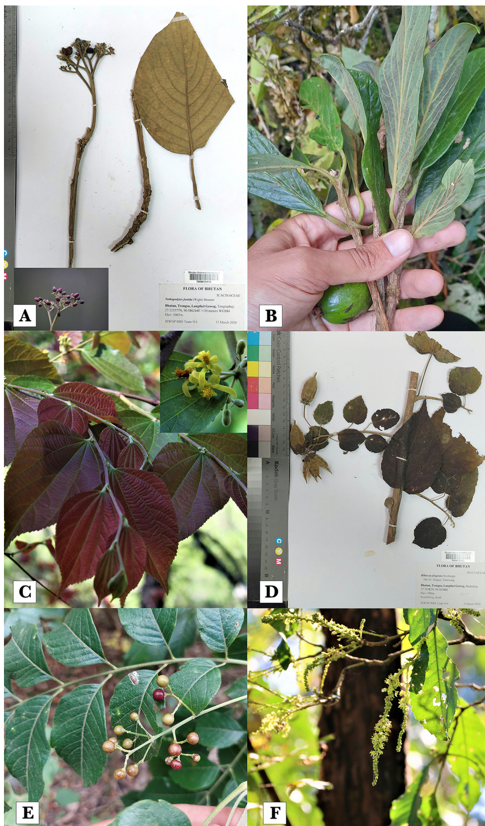
Fig. 3. Newly recorded plant species. A. Nothapodytes foetida from Langthel, Trongsa. B. Machilus edulis from Zhemgang. C. Grewia asiatica from Mongar. D. Hibiscus fragrans from Langthel, Trongsa. E. Cipadessa baccifera from Sergithang, Tsirang. F. Baccaurea javanica from Lamoizhingka, Dagana.